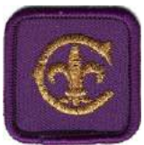
Jack Cornwell Decoration

Top Section Program awards are worn on the right-hand pocket of the youth uniform as well as the Jack Cornwell Decoration for high character and courage by a youth member. Consult the uniform fact sheets from the Scout Shop. The most senior youth top section award is worn on the adult uniform on the right pocket.